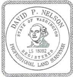
EXHIBIT BOUNDARY LINE ADJUSTMENT